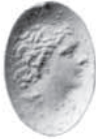
Fig. 16. Gem in the British Museum with portrait comparable to the portraits on the later tetradrachms (after Walters 1926, no. 1228).

be easily recognizable. It is therefore extremely difficult to define what constitutes portraits and what constitutes images of divinities. Take, for example, Vollenweider's catalogue of the gems in Paris. Here no less than eight gems are said to carry representations of Mithridates, only one of which bears any resemblance to the coin portraits. The others depict children or divinities, particularly Dionysos. 40 Obviously there are also gems that have significance for the iconography of Mithridates. Examples include a gem from Pantikapaion, 41 a layered sardonyx, 42 a glass paste 43 all in St. Petersburg, State Hermitage Museum, a gem in Paris, 44 and finally a gem in the British Museum, which is clearly dependent on the second portrait type of Mithridates (Fig. 16). 45