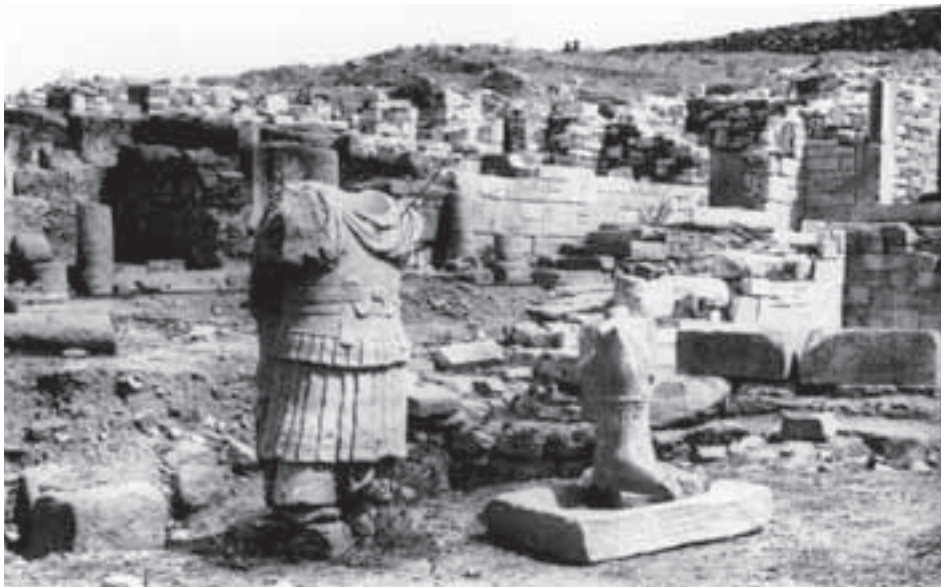
Fig. 15. Delos, Sanctuary of the Kabeiroi. Base for Mithridates VI and headless statue shortly after the excavation.

Portraits on cameos and intaglios constitute a particular problem in relation to the portraits of Mithridates. First of all, no one has yet tried to compile this diffuse material. Secondly, there is generally a surprisingly low correlation between Hellenistic royal portraits on coins and on gems. 39 Gems belonged in the context of court art and, contrary to the public images, did not need to