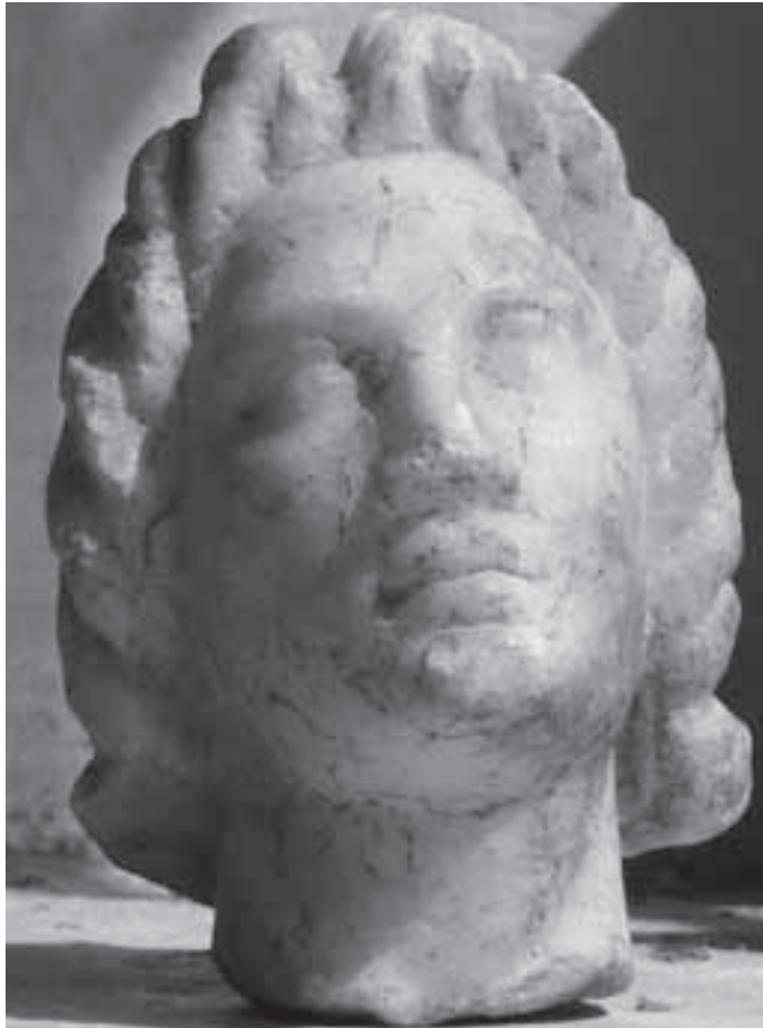
Fig. 13. Portrait found on the acropolis in Pantikapaion. Kerch Lapidarium, inv. no. 1900.

to accept on account of the goat's horns. A few Argead kings, in particular Antigonos Gonatas, seem to have identified themselves with Pan, but there is no evidence to support the idea that Mithridates should have done the same.