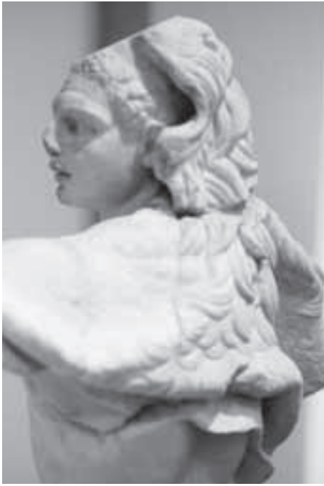
Fig. 8. Herakles with portrait features from the Prometheus group from Pergamon, now in Berlin.