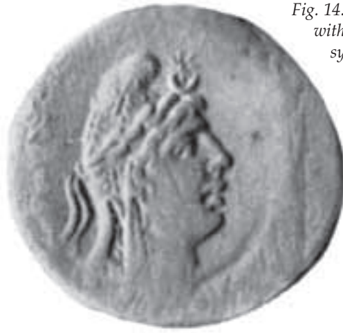
Fig. 14. Obol of Pantikapaion with Men with the Pontic symbol, crescent and six-rayed star.

There is furthermore a drilled hole on top of the head at the intersection of two grooves, and the back of the head was obviously not meant to have been visible. The portrait therefore carried some sort of headdress. One solution could be a Phrygian cap adorned with stars, like the one we see on a bronze portrait of Queen Dynamis in the State Hermitage Museum 33 and on coins struck in Pantikapaion with a figure of Men (Fig. 14). 34 The latter interestingly carries the Pontic symbol star and crescent to denote its origin. Other reconstructions for the headdress are of course also possible.