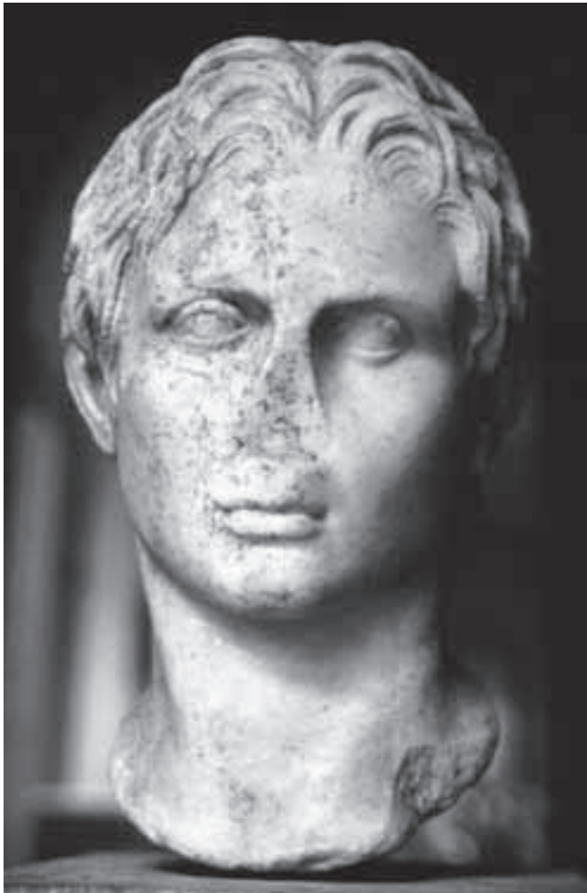
Fig. 1. So-called “Schwarzenberger Alexander” in München Glyptotek (author’s photo).