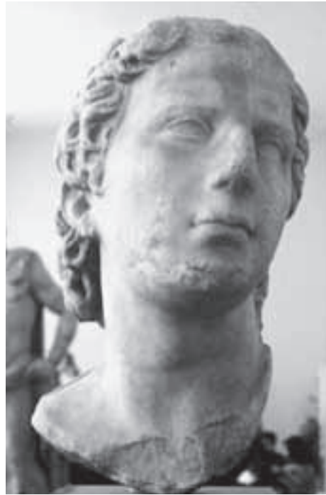
Fig. 11. Portrait in the National Museum in Athens, NM 3556.

many of the characteristics of the head in Ostia. 28 The second, the so-called Inopus head, named after its finding place, seems to be a hybrid between Alexander and another king. 29 The proximity to the Kabeirion where portraits of Mithridates definitely were erected makes him a likely but far from certain candidate. The third portrait, the so-called horned king, 30 I find very difficult