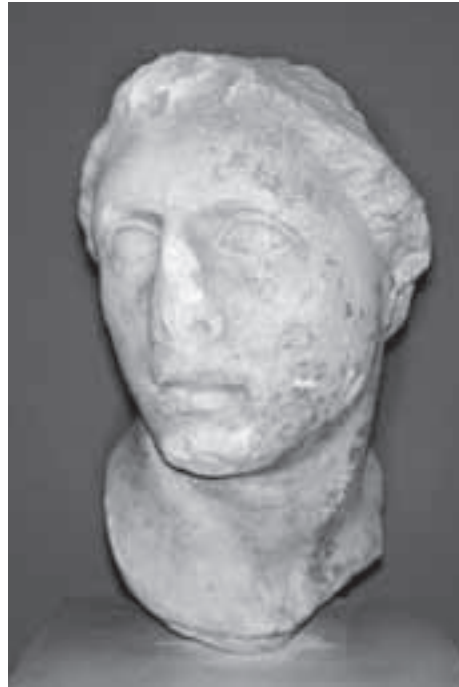
Fig. 9. Portrait from Pantikapaion, now in St. Peterburg.

Odessa Museum (Fig. 10), without provenience but most probably from the area, may have belonged to an acrolithic statue. 25 It has the same dramatic turn as the Pantikapaion head and a pronounced Alexander-like treatment of the hair that is reminiscent of the second portrait type. The same scheme is found in royal portraits found in Athens (Fig. 11) and in Ostia (Fig. 12). 26 All four heads belong to the late second to early first century BC and can be said to have a very general resemblance to the coin portraits of Mithridates without reproducing them exactly. The presence of two of them within the Pontic sphere of influence makes it probable that they portray Mithridates or alternatively one of his sons. The head in Athens is most often associated with Ariarathes IX, but the portraits on his coins are nearly impossible to distinguish from those of his father. 27