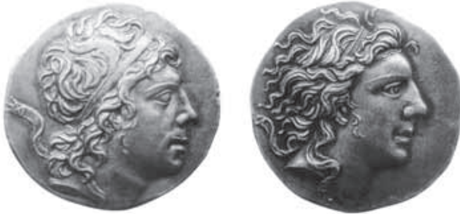
Figs. 2a-b. Tetradrachms of Mithridates VI. a) early portrait type before 85 BC. b) later portrait type after 87 BC.