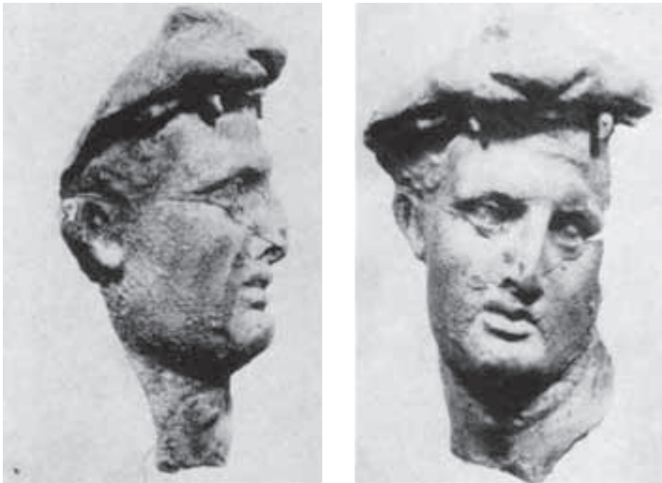
Fig. 7. Terracotta head in lion exuviae found in Sinope (after Akurgal & Budde 1956).

We are on safer ground with two portraits from the northern Black Sea region. One found in Pantikapaion (Fig. 9), definitely shows a royal figure with a sharply turned head. 24 Unfortunately, the whole upper part of the head is lost, and we cannot tell how the hair once was shaped. The other portrait in