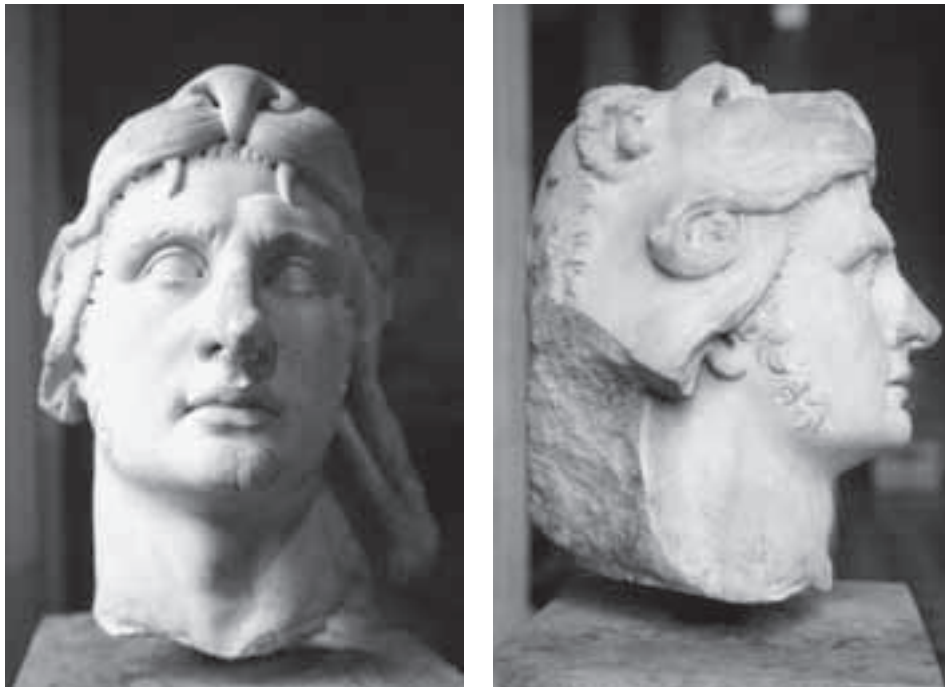
Figs. 6a-b. Mithridates VI in lion exuviae . Louvre, MA 2321.

Among the sculpted portraits one stands out in particular: the marble portrait with lion exuviae in Paris (Fig. 6a-b). 17 In many respects this portrait resembles the first portrait type. The profiles are nearly congruent: both have heavy brows and a pronounced chin, and the same long sideburns. The only objection one could raise is that if it wasn't for the identification with Mithridates we might have guessed the portrait to be somewhat earlier than Mithridates. While no one has seriously questioned the identification of the Louvre portrait, there is more reason to be cautious about the many other Herakles statues and statuettes that have followed in its slipstream.