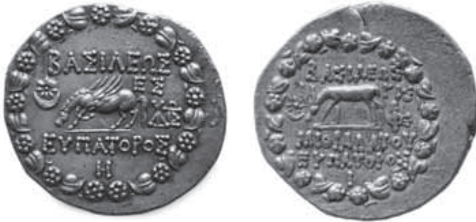
Figs. 4a-b. Tetradrachms of Mithridates VI. a) early type with pegasos (SNGCop 18, 234). b) later type with grazing hind (SNGCop 18, 233).

never existed – perhaps the preserved material is simply too small to reveal it. 7