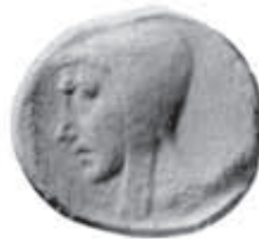
Fig. 5. Pontic anonymous obol with possible portrait features of Mithridates VI.

Portraits of Mithridates have been suggested on other coin issues as well. Coins imitating the tetradrachms of Alexander struck in Messembria and Odessos under Mithridates have been suggested to carry his portrait in the guise of Herakles, but in a large study of the coinage