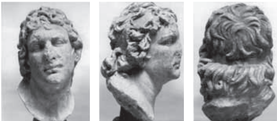
Fig. 12. Portrait from Ostia, now in Frascati (after Calza 1964, pl. 7).

many of the characteristics of the head in Ostia. 28 The second, the so-called Inopus head, named after its finding place, seems to be a hybrid between Alexander and another king. 29 The proximity to the Kabeirion where portraits of Mithridates definitely were erected makes him a likely but far from certain candidate. The third portrait, the so-called horned king, 30 I find very difficult