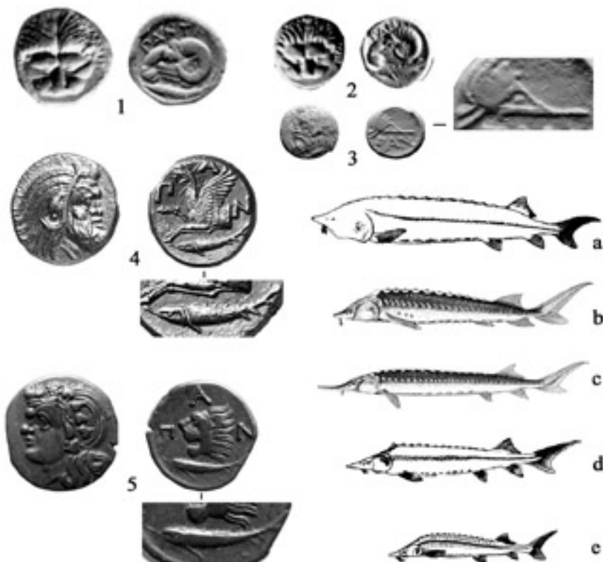
Fig. 3. Coins of Pantikapaion. 1-2) AR; 3-5) AE. Sturgeon species: a) Beluga; b) Russian sturgeon; c) Starry sturgeon ( sevyuga ); d) Fringebarbel sturgeon; e) Sterlet. (1-2: after Anochin 1986, nos. 67-68; 3: Museum Narodowe Warsaw, inv.-No. 105512, after a cast; 4: Gorny & Mosch auction 118, lot No. 1150, photo courtesy of the Gorny & Mosch Giessener Münzhandlung; 5: Danish National Museum, Collection of Coins and Medals, SNG Cop. 6.35, photo courtesy of the Museum.)

In 1964 this motif was discussed in a special article by V.M. Brabič. Following Šelov in identifying the fish as a Russian sturgeon, he suggested regarding the entire composition as semantically interdependent. According to this view, both lion and griffin appear to carry out a protective function regarding grain and fish, which were the basic commodities of the Bosporan trade. 25 Taking into account the Greek belief that the griffins guarded gold from the Arimaspians on the northern edge of oikoumene (Hdt. 3.116.1; 4.13.1. Cf. Aisch., Pers. 804) this cannot be completely ruled out. However, it seems that the coin emblems allow more accurate attribution of the fish species. A distinctive long snout pointed at the tip, which is clearly discernible on the