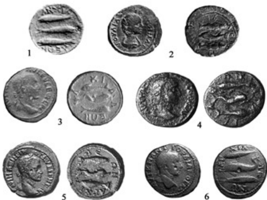
Fig. 5. Bronze coins of Anchialos. 1) Crispina; 2) Julia Domna; 3-5) Maximinus; 6) Gordianus III. (1: after Struck 1912, pl. 6.22; 2: auction Gorny & Mosch 118, lot No. 1631, photo courtesy of the Gorny & Mosch Giessener Münzhandlung; 3: photo courtesy of the Aeqvitas.com (Heather Howard); 4: photo courtesy of Thomas Burger; 5: auction Lanz 102, lot No. 831, photo courtesy of the Numismatik Lanz; 6: in commerce, photo courtesy of the Classical Numismatic Group, Inc.)

ian coasts of the Black Sea. 42 Being regarded as a goddess of fertility she was particularly popular among the female population. Apparently therefore, it is not fortuitous that the overwhelming majority of the coin types of the city showing two fishes were issued in the name of empresses, while the emperors mostly preferred other emblems. 43